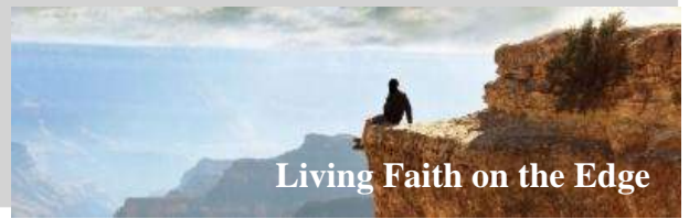
Living Faith on the Edge